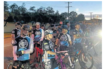
WHEELIE GOOD: A large group of riders was on hand.